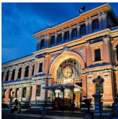
Old Post Office