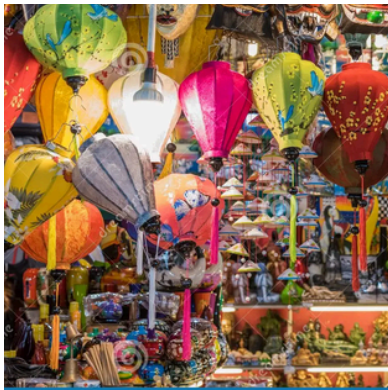
Ben Thanh Market