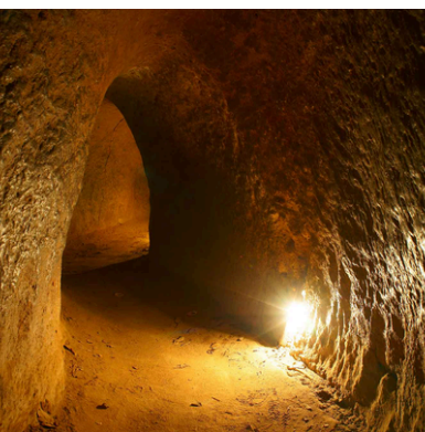
Cu Chi Tunnels