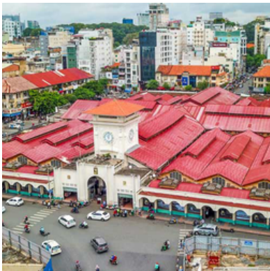
Ben Thanh Market