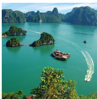
Hoang Long River