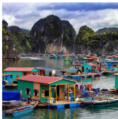
Ba Hang Fishing Village