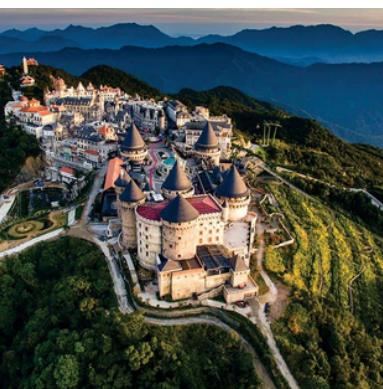
Sun World Ba Na Hills