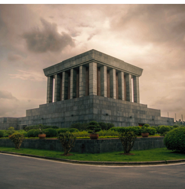
Ho Chi Minh Mausoleum