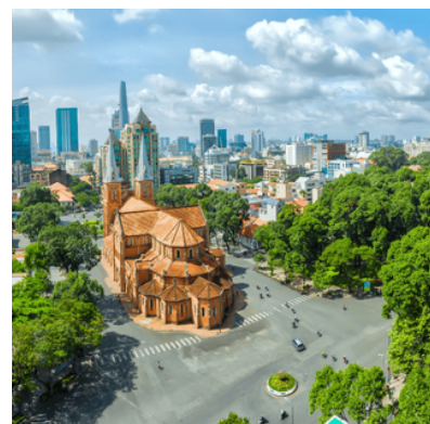
Ho Chi Minh City