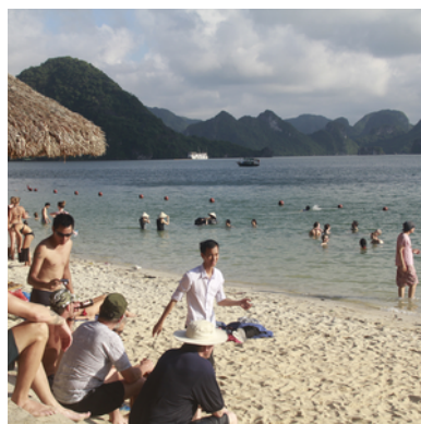
Soi Sim Beach