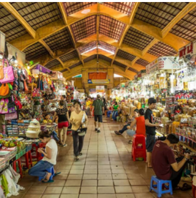
Ben Thanh Market